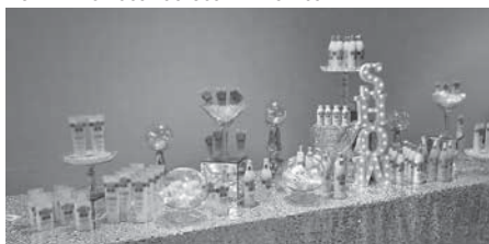
Chrisman Show Products