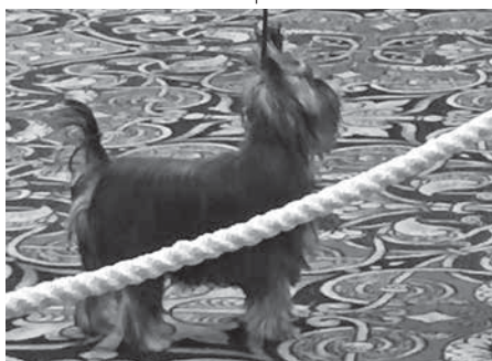
Carasel's Bettino's first show