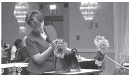
Bon' Amis Escandalosa En' Vanica