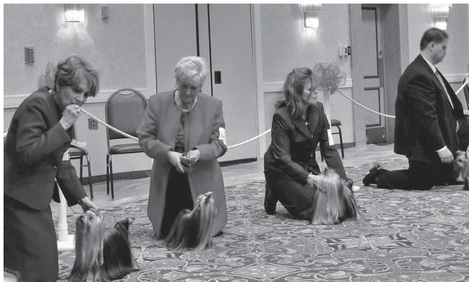
Best of Breed Competition