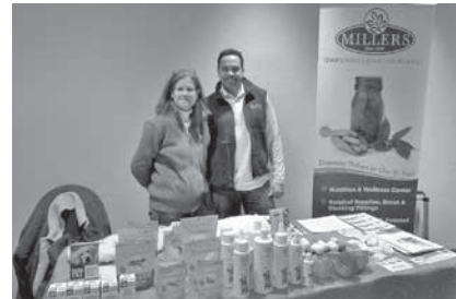
Millers Pharmacy, Wyckoff, NJ